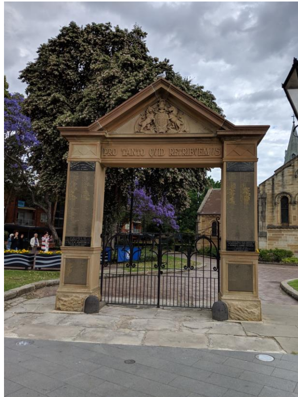
St. John's Anglican Cathedral Memorial Arch, Parramatta