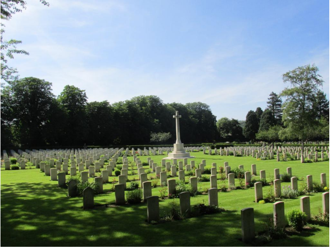
Botley Cemetery